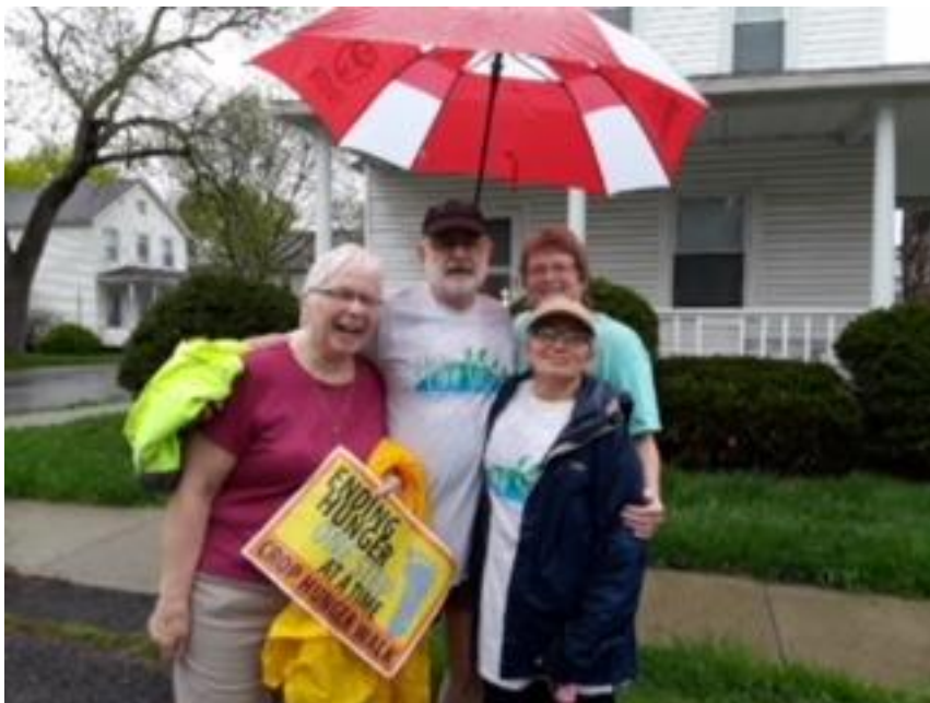
photo from the Ravena CROP Walk

No client is ever turned away. Once a month, each client receives twelve meals worth of food. If they are in need of more food that same month, they are given nine more meals. If a person in need is not from our area, they are served and referred to the food pantry in their area. All donations are greatly appreciated.